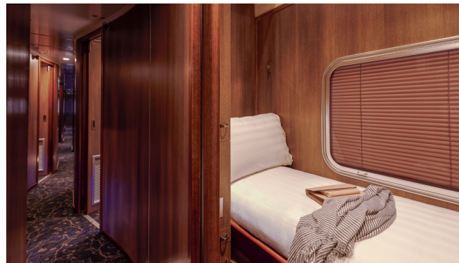
Gold Single Cabin by Night