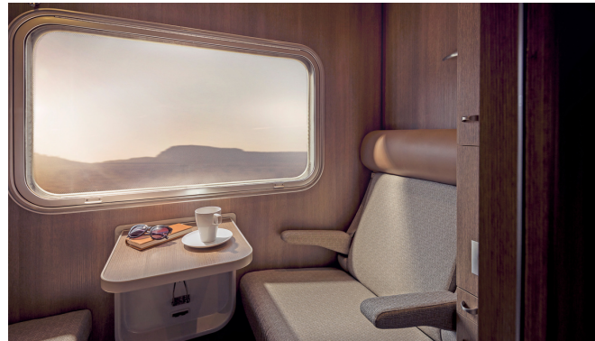
Gold Single Cabin by Day