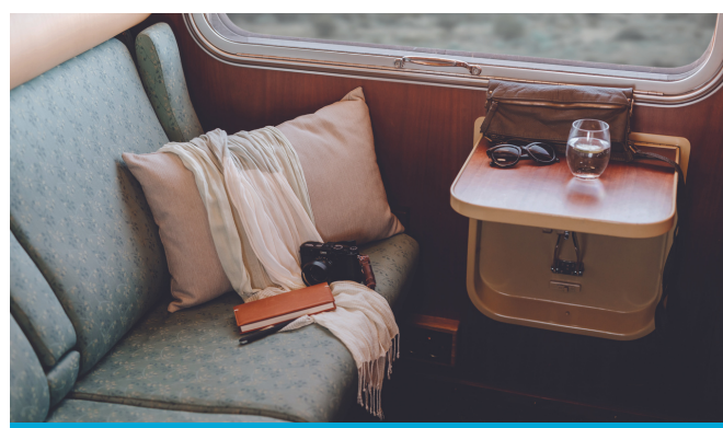
Gold Twin Cabin by Day

Australia's iconic rail journeys offer purpose-built carriages to do it in superb style. Our Gold Single is a comfortable sleeper cabin option that offers all the luxurious inclusions of the Gold Twin such as fully inclusive dining with three gourmet meals per day, all-inclusive Australian wines, beers, base spirits and non-alcoholic beverages, and your choice of Off Train Experiences as you travel.