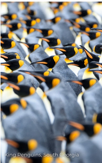
King Penguins, South Georgia