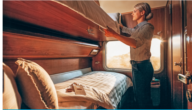
Gold Twin Cabin by Night