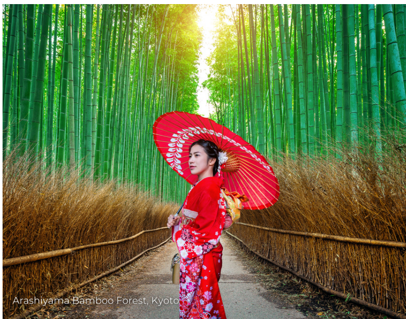
Arashiyama Bamboo Forest, Kyoto