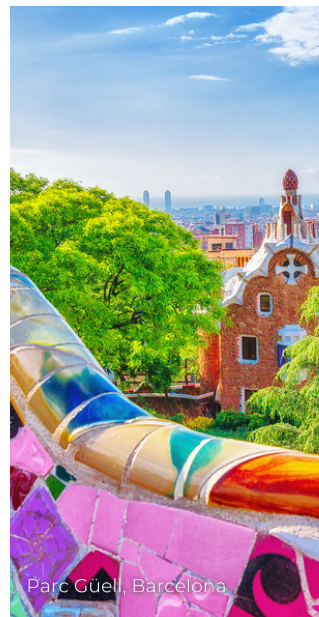
Parc Güell, Barcelona