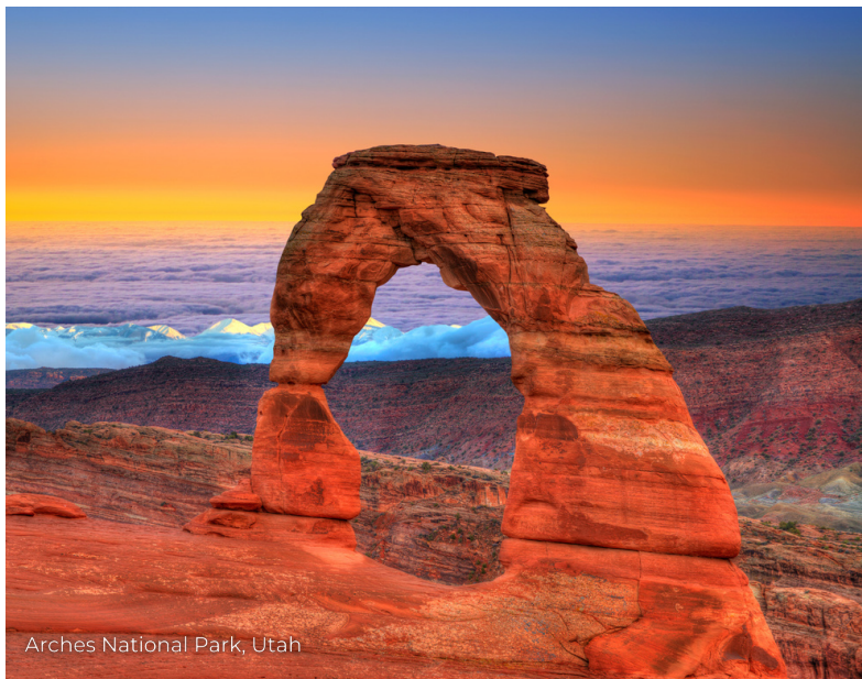
Arches National Park, Utah