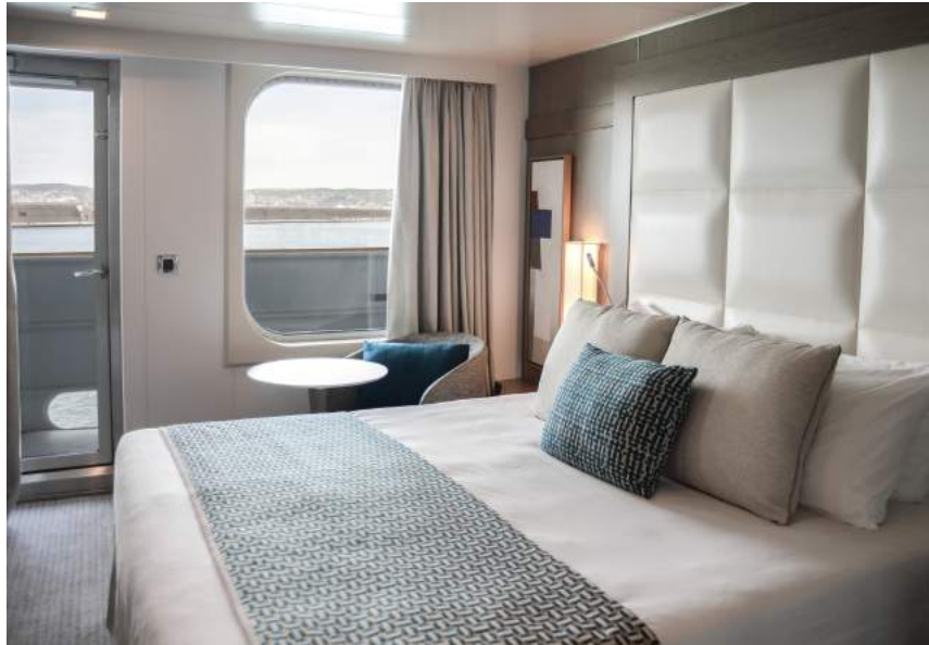
Deluxe Stateroom | Deck 3