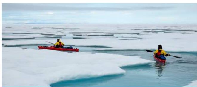
Kayak Discovery | Antarctic Peninsula

Located in southwestern Tierra del Fuego province, over the borderline with Chile, this National Park is the southernmost example of the Andean – Patagonian forest. Explore this fascinating area on a day tour prior to embarking our ship. (This tour must be pre-booked and paid with your final payment. The tour is subject to availability) Available for $120 per person