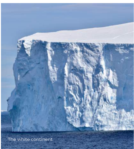
The white continent