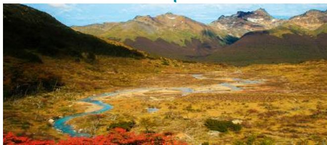
Tierra Del Fuego National Park Tour | Ushuaia

Located in southwestern Tierra del Fuego province, over the borderline with Chile, this National Park is the southernmost example of the Andean – Patagonian forest. Explore this fascinating area on a day tour prior to embarking our ship. (This tour must be pre-booked and paid with your final payment. The tour is subject to availability) Available for $120 per person