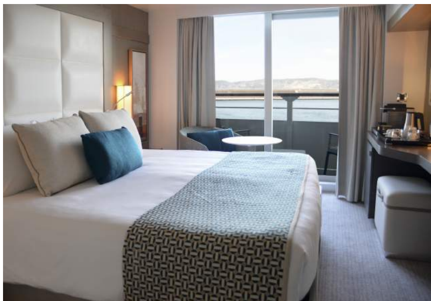
Prestige Stateroom | Deck 4 or 5