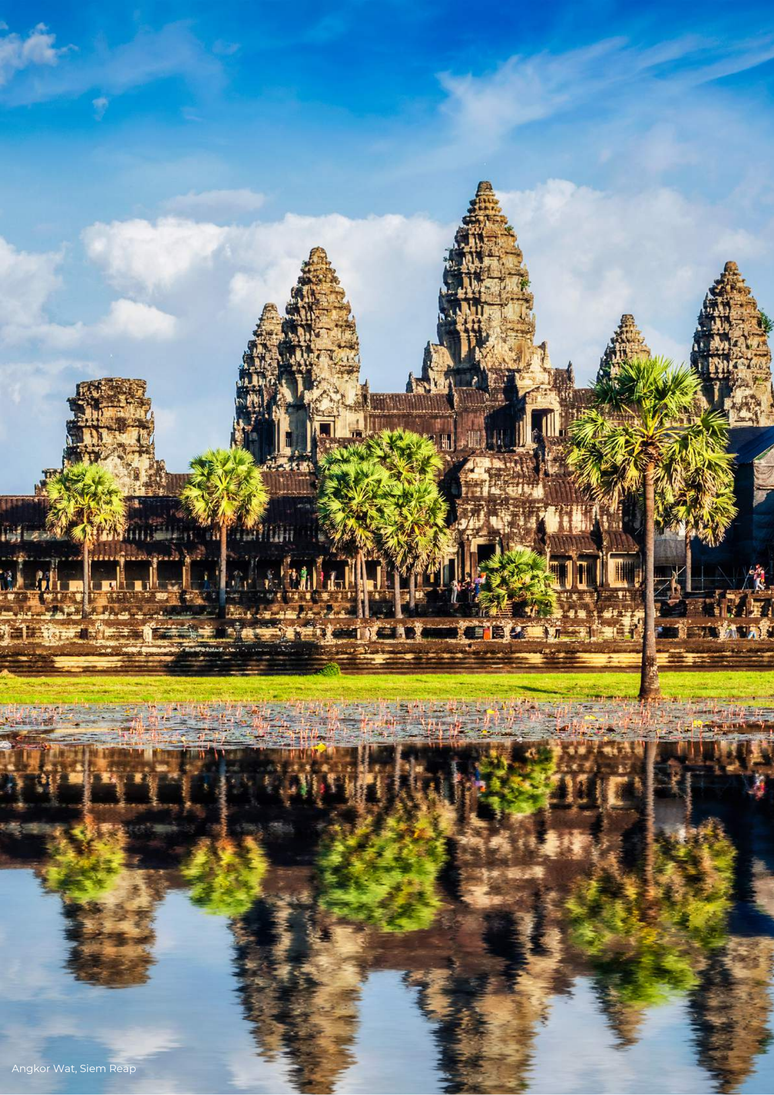
Angkor Wat, Siem Reap