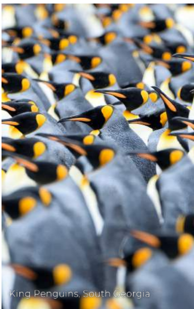
King Penguins, South Georgia