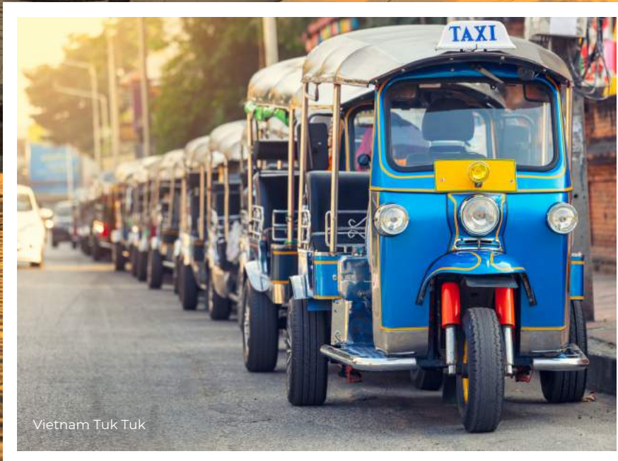
Vietnam Tuk Tuk