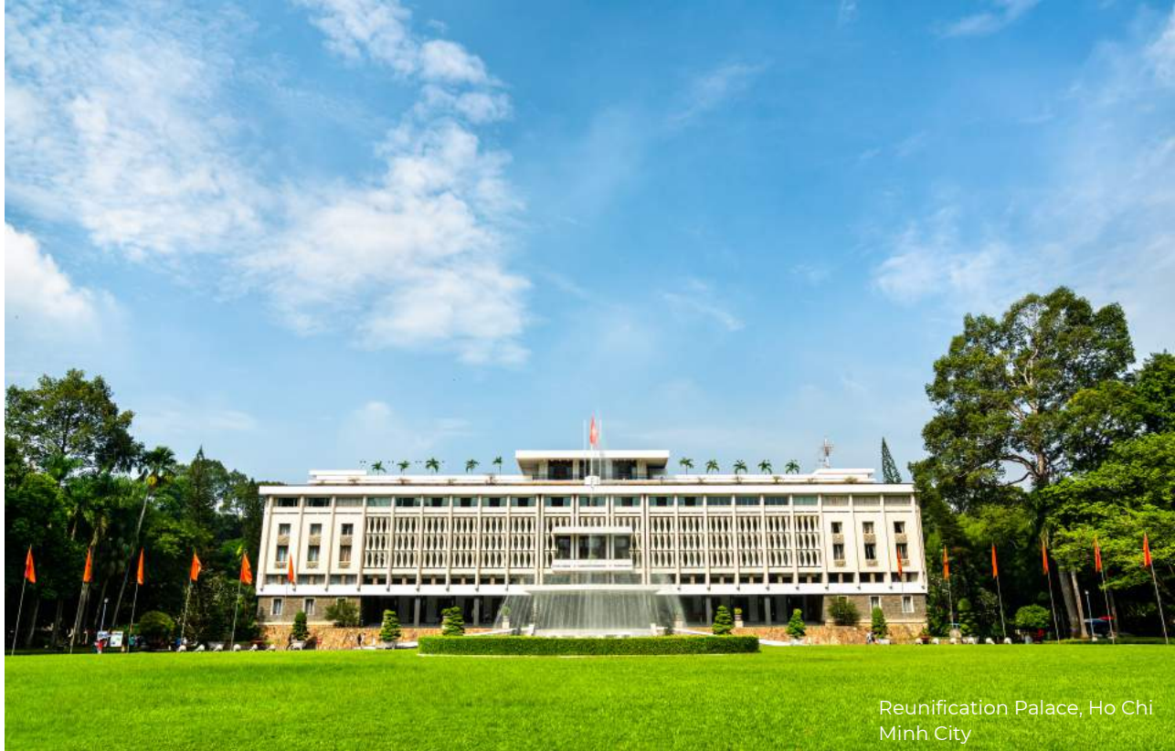
Reunification Palace, Ho Chi Minh City