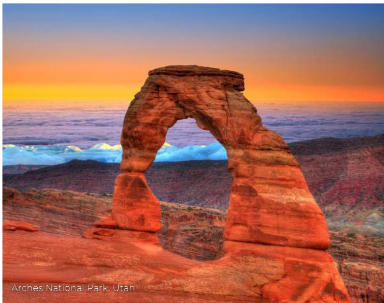
Arches National Park, Utah