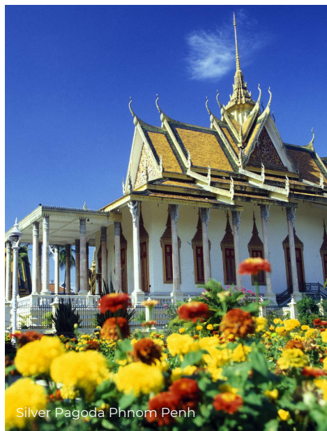
Silver Pagoda Phnom Penh