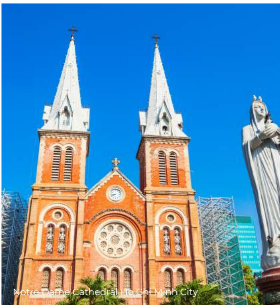
Notre Dame Cathedral, Ho Chi Minh City

The river's timeless beauty is matched only by the warmth of the local communities that dot its shores. Friendly waves from villagers, the vibrant colors of floating markets, and the rhythmic chants of monks emanating from riverside monasteries all contribute to the immersive experience. Aboard the well-appointed Victoria Mekong, expect to savor the fusion of modern comfort and authentic ambiance, with luxurious cabins and observation decks that frame breathtaking vistas.