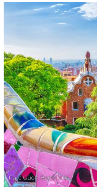
Parc Güell, Barcelona