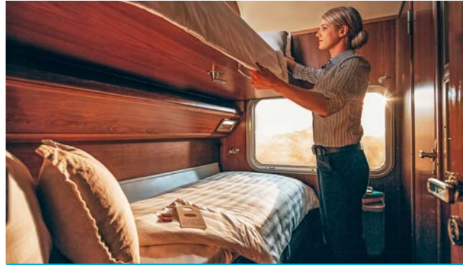
Gold Twin Cabin by Night