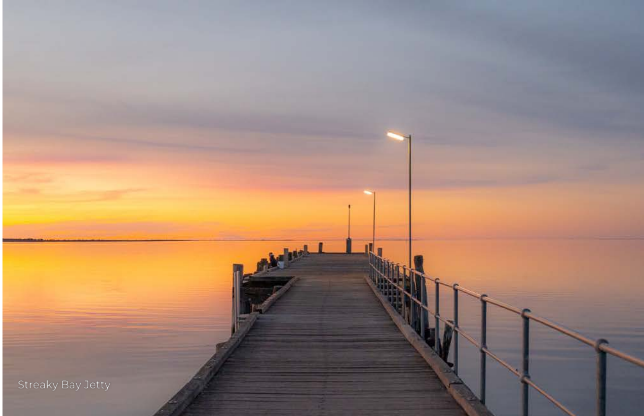
Streaky Bay Jetty