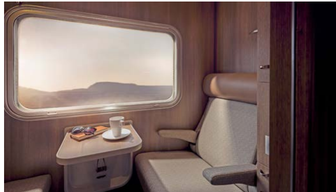
Gold Single Cabin by Day