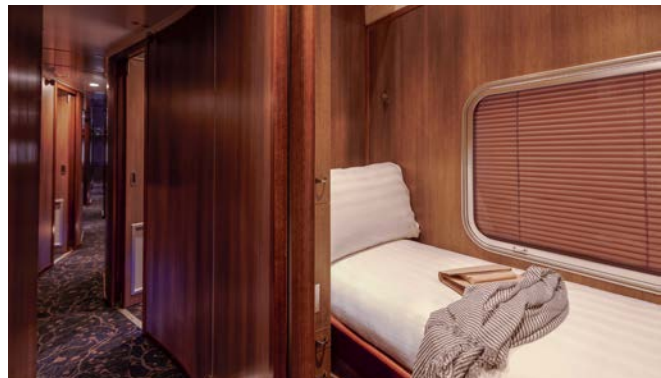
Gold Single Cabin by Night