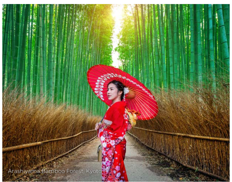
Arashiyama Bamboo Forest, Kyoto