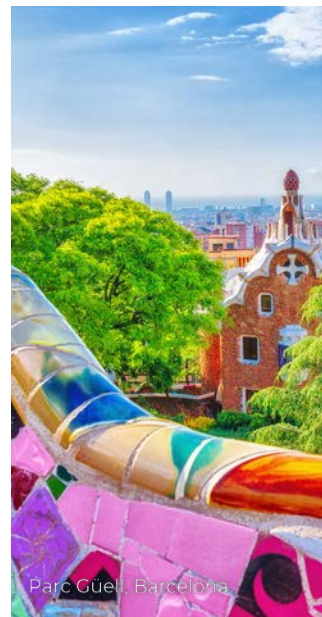
Parc Güell, Barcelona