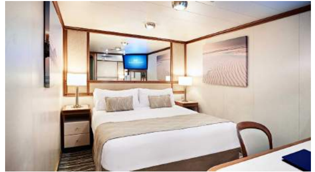
IB - Interior Cabin