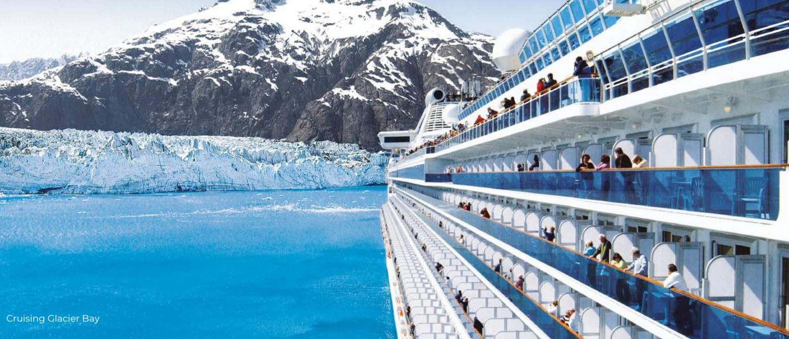
Cruising Glacier Bay