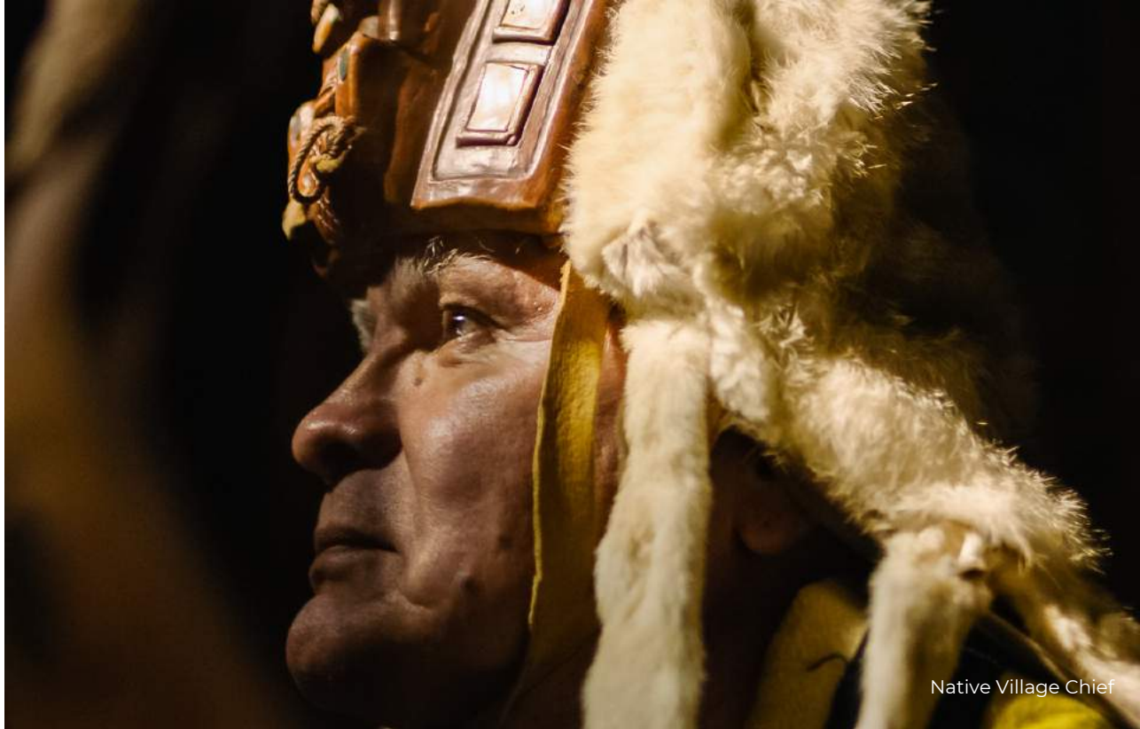
Native Village Chief