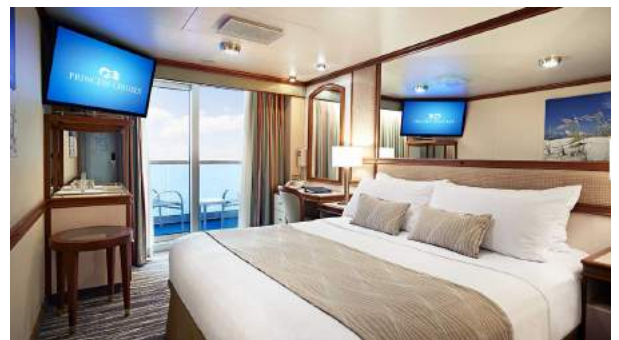
BA - Balcony Cabin