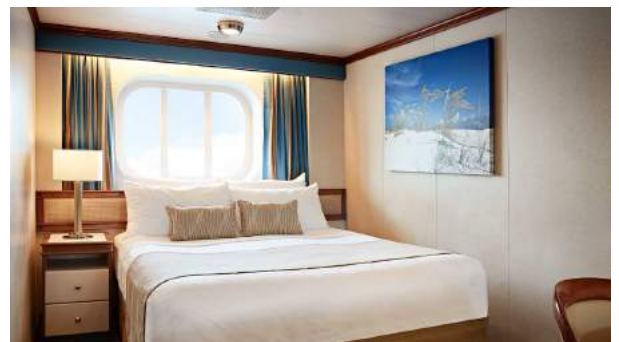
O3 - Oceanview Cabin